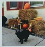
House cat Hobgoblin "Hobs"