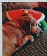
House Dog Werthers