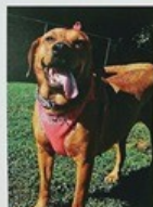
House Dog Cherry